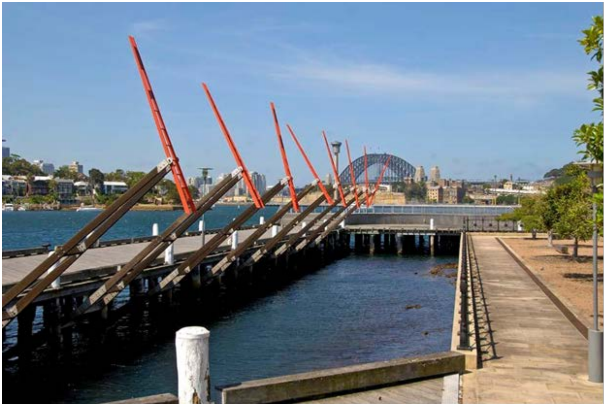
Tide to Tide Sculpture

The sculpture consists of eight composite units secured to the wooden deck beams of the jetty/boardwalk. Each unit is 11.5 meters long and has a 4.4 metre tapered ladder attached by an axle at one end. Each unit has a 1500 x 1000 x 300 rectangular hollow fiberglass float and counter weight attached by a stainless steel axle at the other end and is pivoted at the third point by /stainless steel pins secured to a steel suspension unit (this unit being bolted to the underside of the jetty). Each unit weighs approximately 850 kg without ballast water. The units adopt different positions depending on the tide; they will rise high out of the water at low tide and hover closer to the water at high tide.